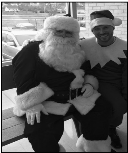
Santa Claus and Chuckles the Elf at the Pevely Elementary Christmas Assembly.

The administrative team at Pevely Elementary hopes you had a wonderful holiday with family and friends. We look forward to the many great things the New Year brings!