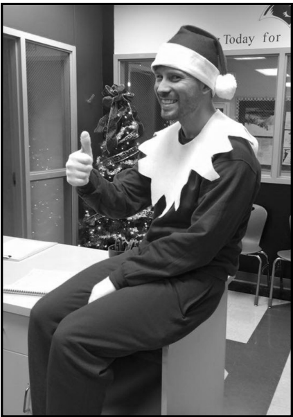
“Chuckles the Elf”...on a shelf, in the Pevely Elementary office.

The administrative team at Pevely Elementary hopes you had a wonderful holiday with family and friends. We look forward to the many great things the New Year brings!