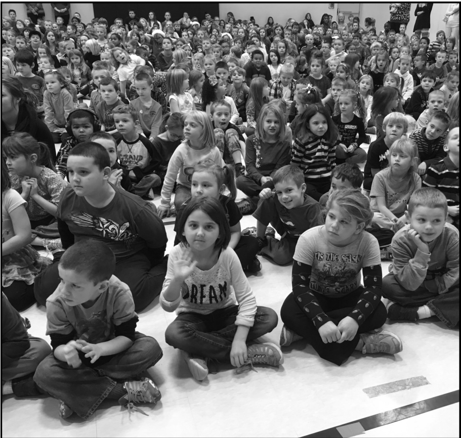
Students wait anxiously for Santa to arrive at the Christmas Assembly